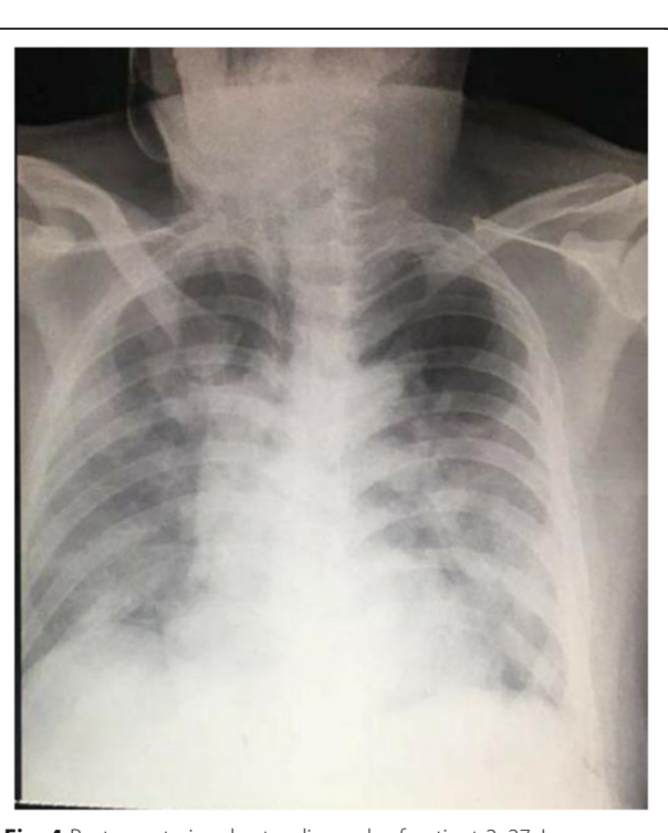
Fig. 4 Posteroanterior chest radiograph of patient 2, 27 January 2020 (illness day 10). Hazy infiltrates in both lung fields consistent with pneumonia

On illness day 12, he became increasingly dyspnoeic, hypoxic and agitated and was intubated and sedated with a midazolam drip. An endotracheal aspirate (ETA) and a further NPS/OPS were collected and sent to the RITM. Vancomycin, 30 mg/kg loading dose followed by